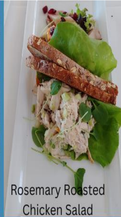
Rosemary Roasted Chicken Salad