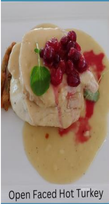
Open Faced Hot Turkey