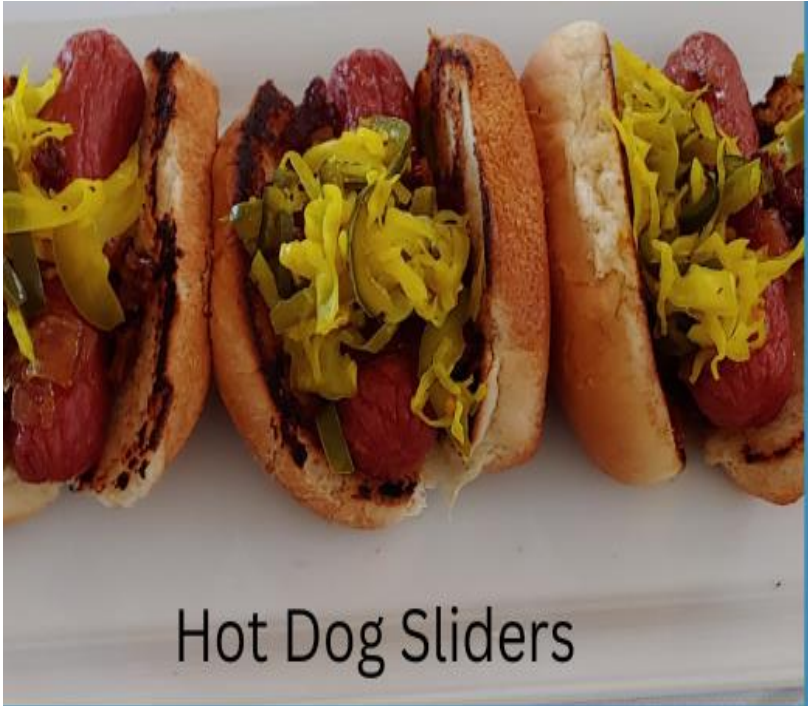
Hot Dog Sliders